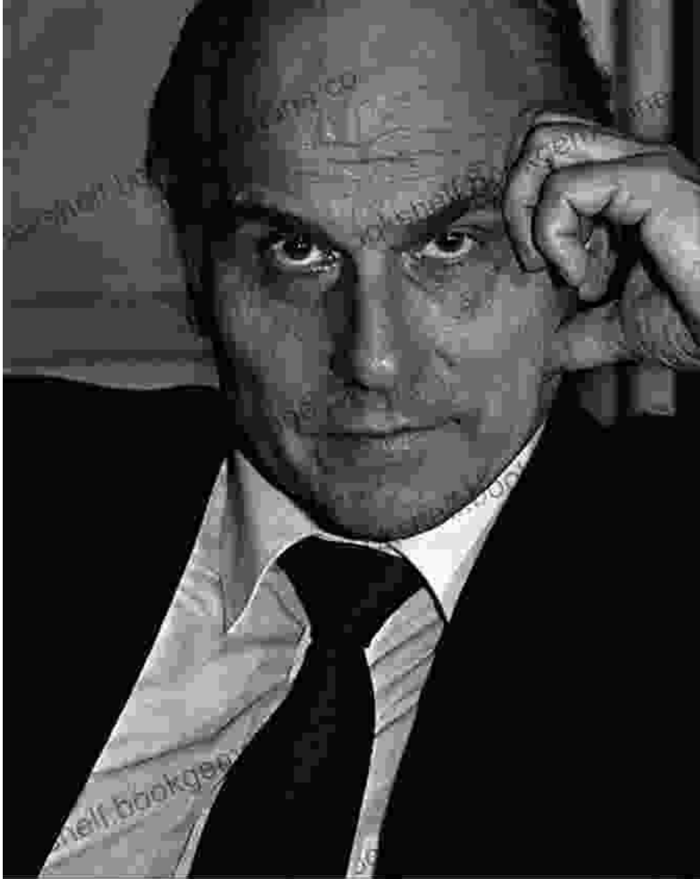
Ryszard Kapuscinski, "Solidarity," 1980s