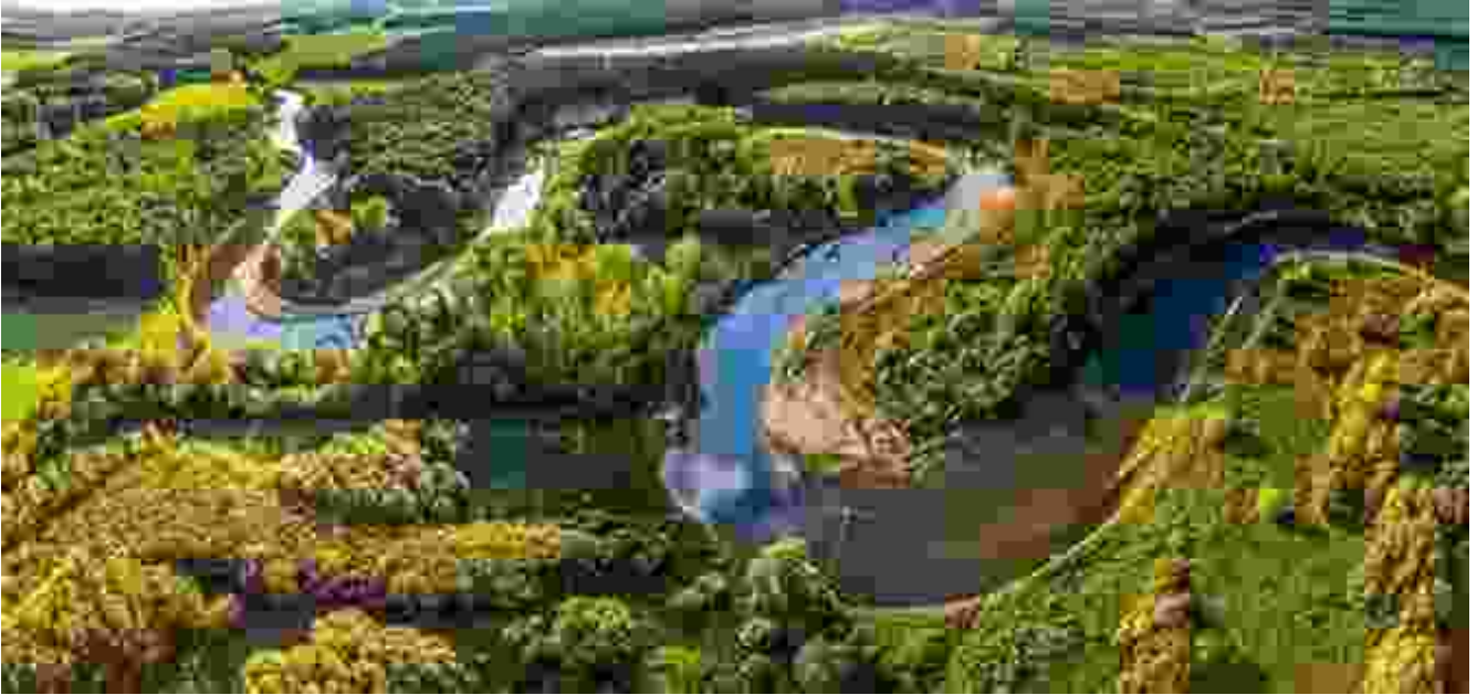
Yukon River, Yukon