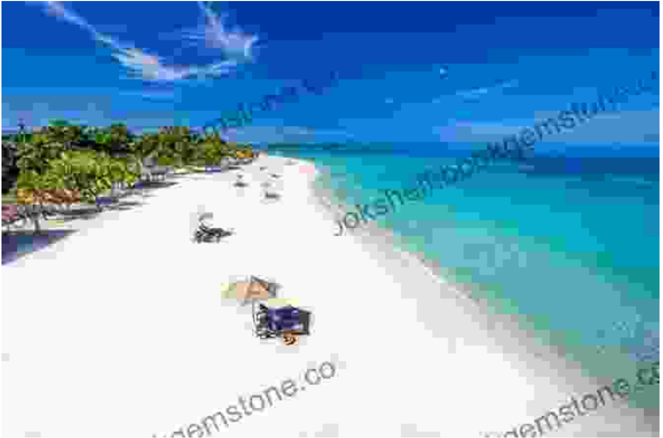
Seven Mile Beach, Negril, Jamaica