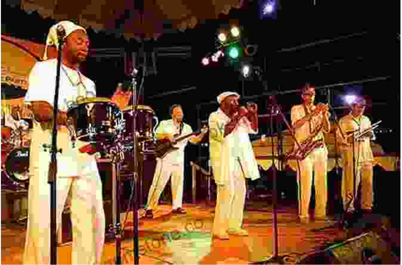
Reggae musicians, Negril, Jamaica