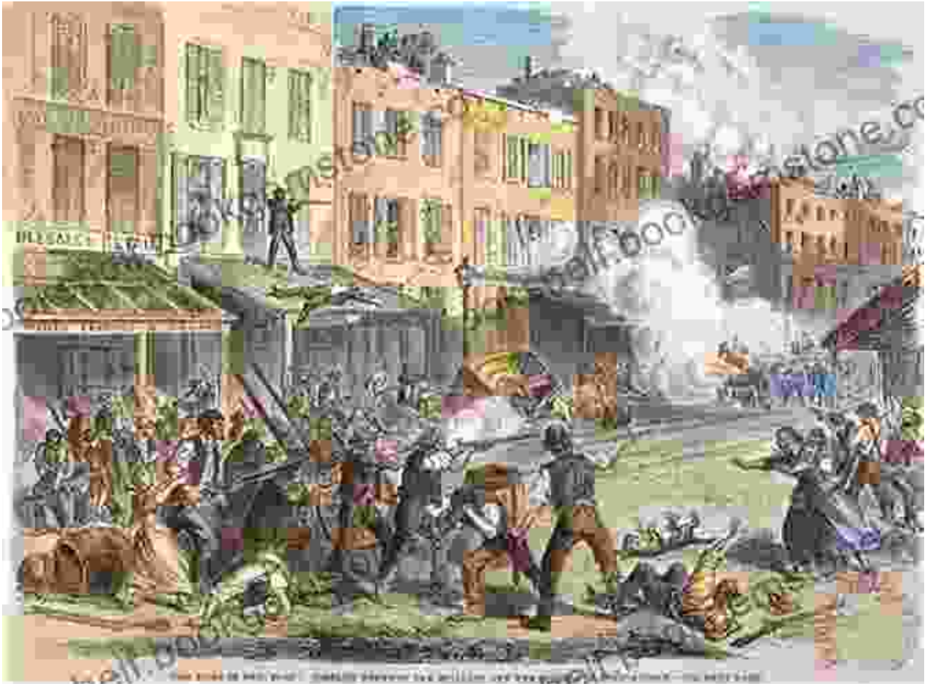
A painting depicting the Lawrence Riots of 1863.